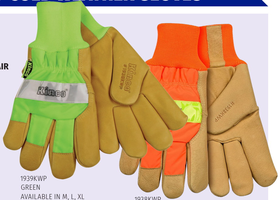
1939KWP GREEN AVAILABLE IN M, L, XL