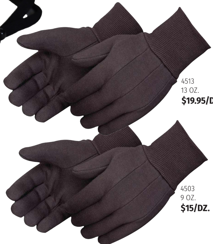
4513 13 OZ. $19.95/DZ.