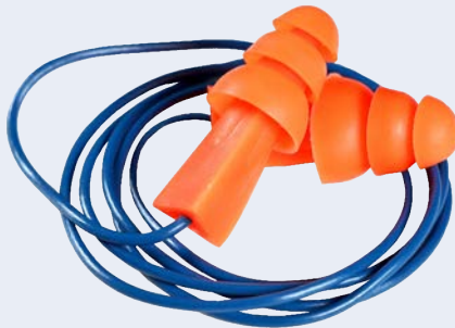
943180 HI-VIZ ORANGE / DARK BLUE