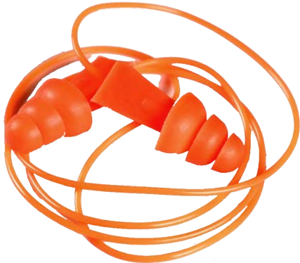
941110 HI-VIZ ORANGE / HI-VIZ ORANGE