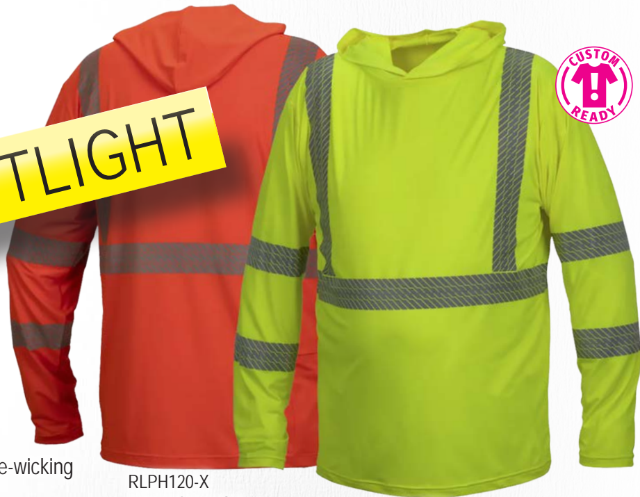
RLPH120-X HI-VIZ ORANGE