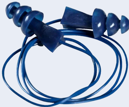
945880 DARK BLUE / DARK BLUE

FOOD SERVICE SAFE • FOOD SERVICE SAFE • FOOD SERVICE SAFE