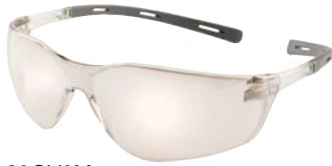
20GY0M MIRROR LENS