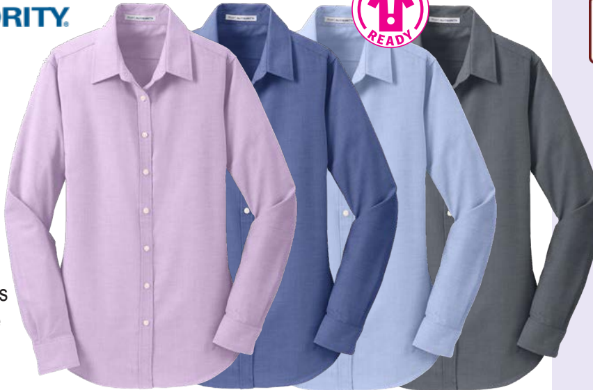
L658-SPUR-X SOFT PURPLE