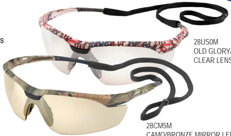
28US0M OLD GLORY/ CLEAR LENS