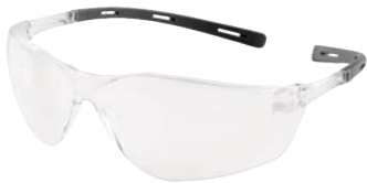
20GY80 CLEAR LENS