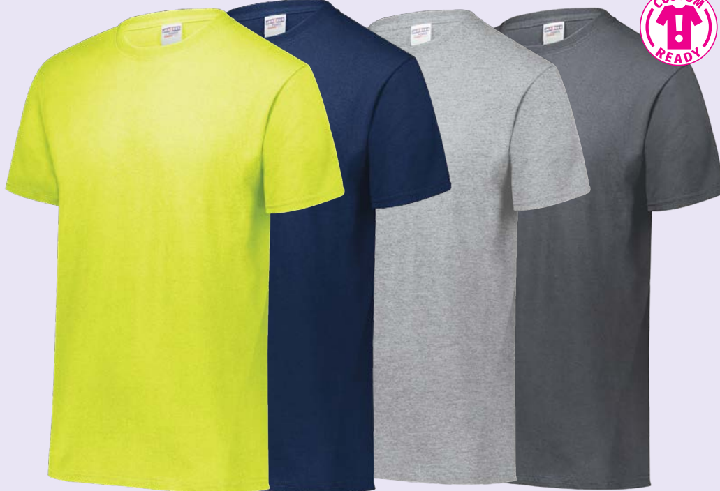
29M-SGRN-X SAFETY GREEN