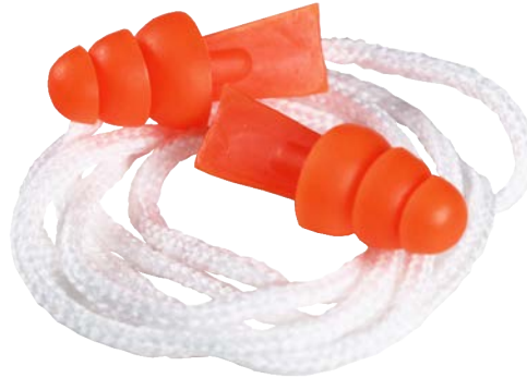
941120 HI-VIZ ORANGE / WHITE