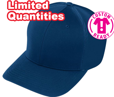
FLEXFIT® VAPOR CAP | $11.50 6300-NVY/NVY-L/XL