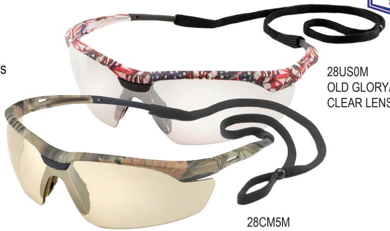
28US0M OLD GLORY/ CLEAR LENS