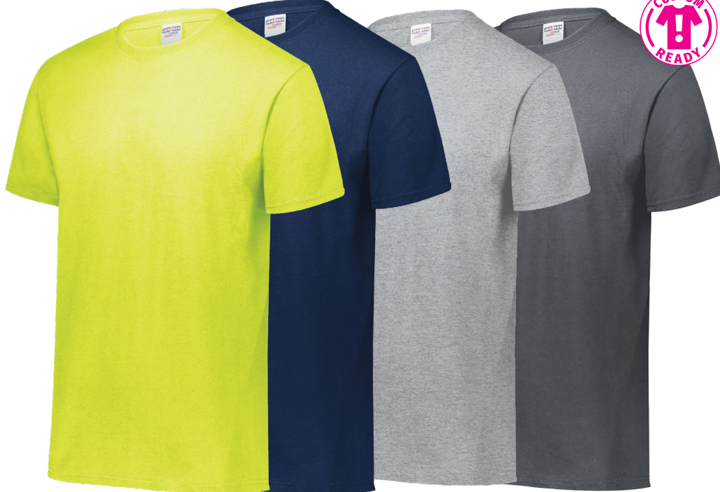
29M-SGRN-X SAFETY GREEN