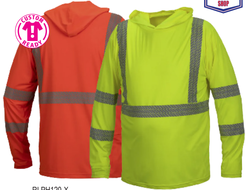
RLPH120-X HI-VIZ ORANGE