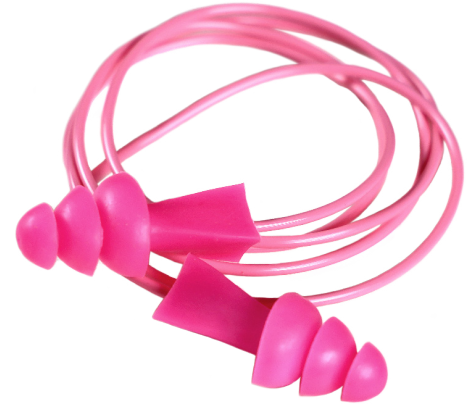
941330 PINK/PINK | $84.25