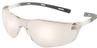
20GY0M MIRROR LENS | $4.75