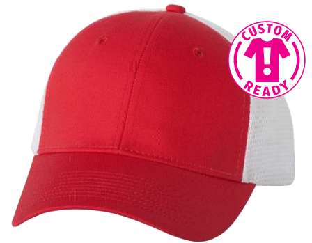
VALUCAP MESH-BACK TRUCKER CAP | $6.39 VC400-RWHT