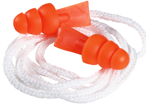
941120 HI-VIZ ORANGE / WHITE | $113.89