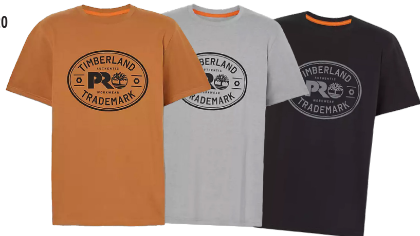
TB0A5MX4P47 WHEAT BOOT