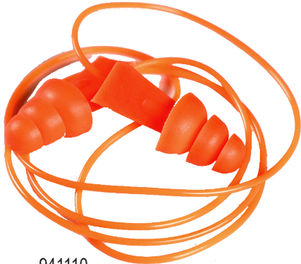
941110 HI-VIZ ORANGE / HI-VIZ ORANGE | $105.10