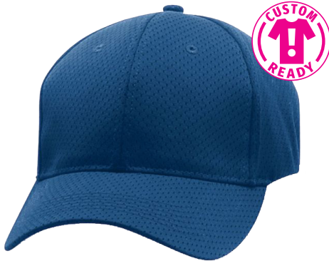
SPORT FLEX ATHLETIC MESH CAP | $9.39 6232-NVY