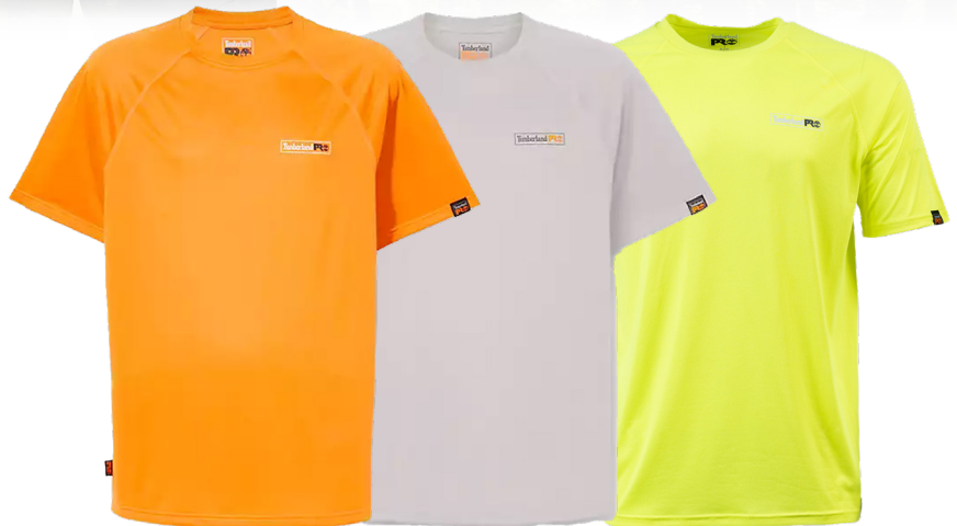
TB0A6DSF835 BRIGHT ORANGE