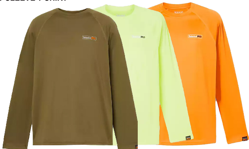
TB0A6D2A360 BURNT OLIVE