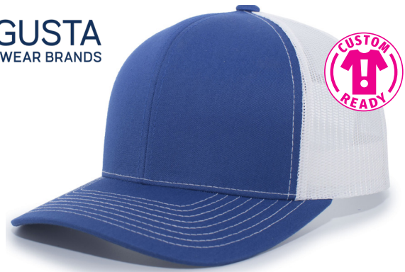
CONTRAST STITCH TRUCKER SNAPBACK CAP | $9.39 104S-RWR