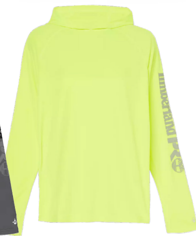
TB0A1V74C77 PRO YELLOW