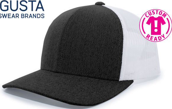
HEATHER TRUCKER SNAPBACK CAP | $14.89 110C-BHWHB