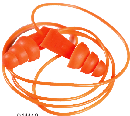
941110 HI-VIZ ORANGE / HI-VIZ ORANGE | $105.10