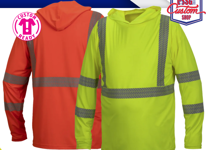
RLPH120-X HI-VIZ ORANGE