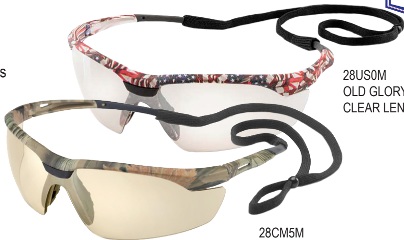
28US0M OLD GLORY/ CLEAR LENS